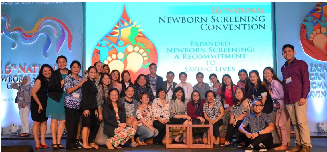
Regional Newborn Screening Program Managers and Coordinators are well represented during the 16th Annual Convention.